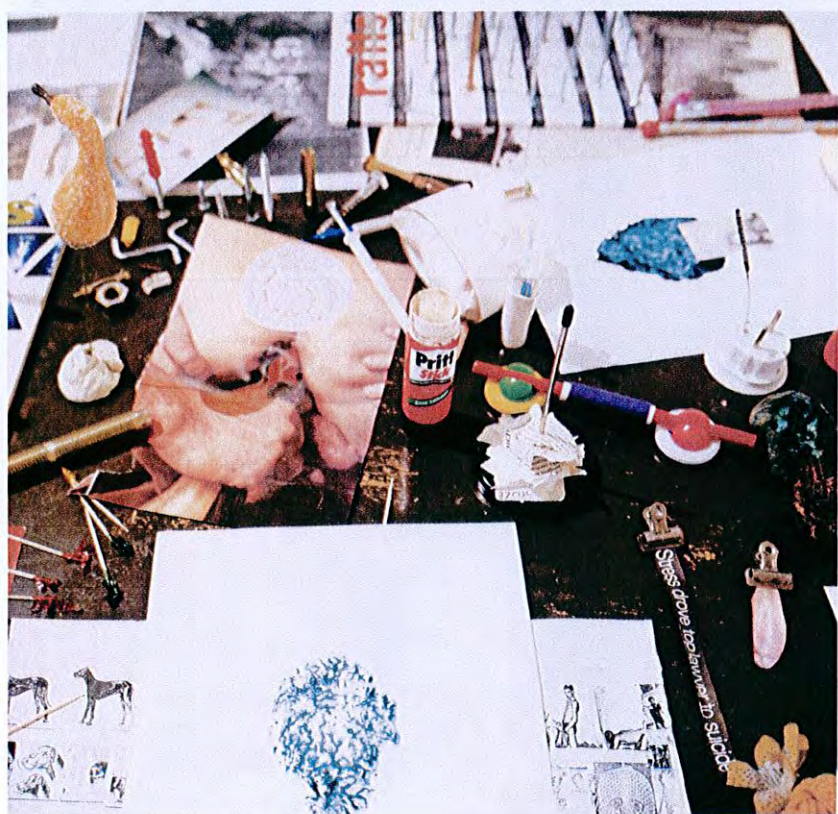
Untitled (detail) 2000 Mixed media Dimensions variable

Similarly, the first of many works using price tags, Untitled (2005), is a floor piece that comprises hundreds of tiny tags spread, unfixated, across the floor. In other works, they find a shape; in The Nature of Price (2005) they form dainty sprig patterns based on floral designs by William Morris. In Untitled (2005) tags are attached, like decorations, to ordinary objects, such as the kind of stick you might throw for a dog. A related work developed around the same time, while on a residency in San Francisco, was prompted when the artist noticed that he kept finding a one-cent coin on his walks. He decided to start collecting them; every single day, without fail, one would present itself – although on the last day it wasn't until the eleventh hour. Many of these coins formed the centrepiece of the work America You, America Now (2006); they were used to make a line drawing of a sailing ship and were included in his 2007 exhibition, 'Everybody Everywhere', at Cabinet Gallery in London. The show also included a second coin wall drawing piece: The Joy of Price (2007), which was based on the cover illustration of the 1970s