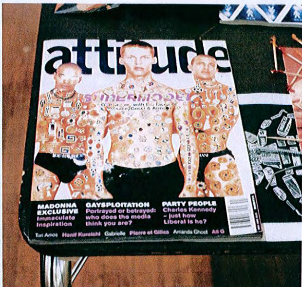
Left: Untitled (detail) 2000 Mixed media Dimensions variable