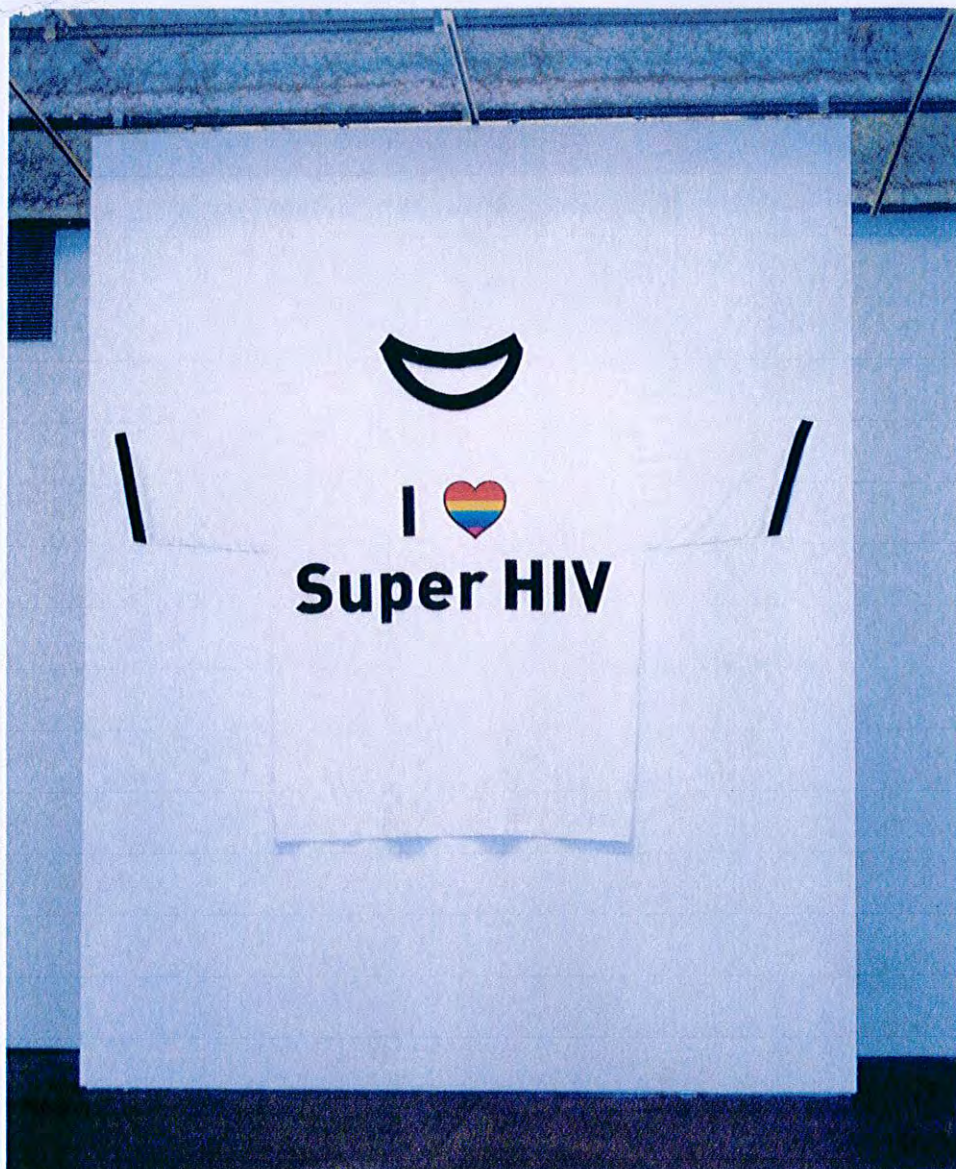
Super Pride and Super Prejudice 2005 T-shirt

In these and other works Alvi's methods and processes – which involve obsessive collecting and 'artistic research', hours of meditative cutting-out and the distilling and reconfiguration of found material – resonates, but not in a way which emphasizes its uniqueness as a value-adder. The artist's labour is an elementary form of interaction: most people, after all, have collected clippings, torn stuff up, used scissors and glue and pinned things on a board or wall. Alvi's modest approach involves engaging with the representational surfaces of 'the given'. He often searches for inconclusive forms and propositions, uncertain futures, physical contingencies and change. Take, for example, the work Fucked Up With Flyers and Aesthetics (1996), which was part of his 2001 solo exhibition at London's Whitechapel Art Gallery. The work comprises peacock feathers, clippings advertising jewellery spread on paper mats, and a seemingly endless amounts of torn up club flyers – good bad and ugly – scattered in piles across the floor; they could easily stick to the soles of visitor's shoes. Instead of seeing clubbers as an alienating, homogeneous mass Alvi preferred to think of the club scenario as a communal, if fractured, celebration of difference. To engage with this installation might involve – like Félix González-Torres' stack pieces and hard-candy piles – also being involved in the work's dissemination and dissipation.